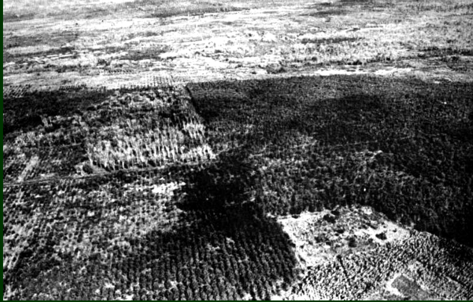
Aerial View: Long Tan Battlefield 18th August 1966