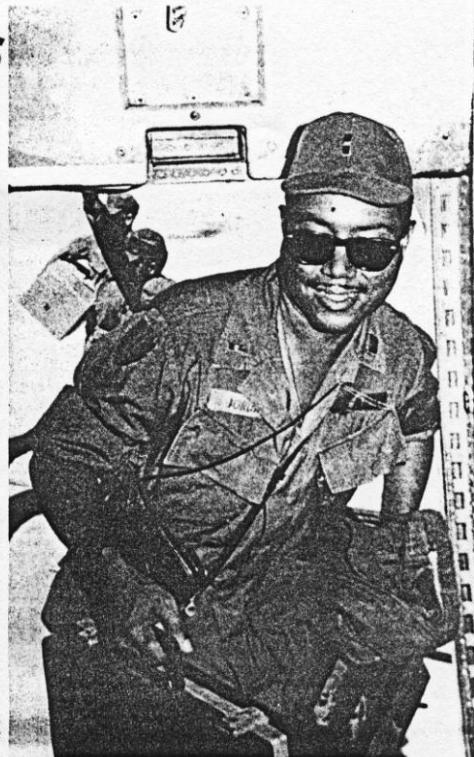
Happiness is boarding a "Freedom Bird."