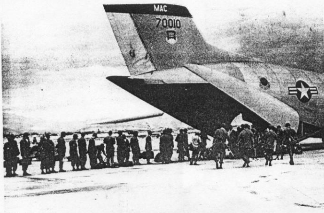
This is it—the last few steps in Southeast Asia