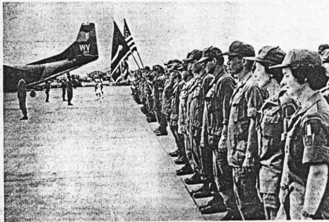
Doctors, nurses, and technicians await the order to board their flight home.