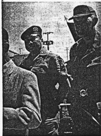
provincial chief thanks the 312th.