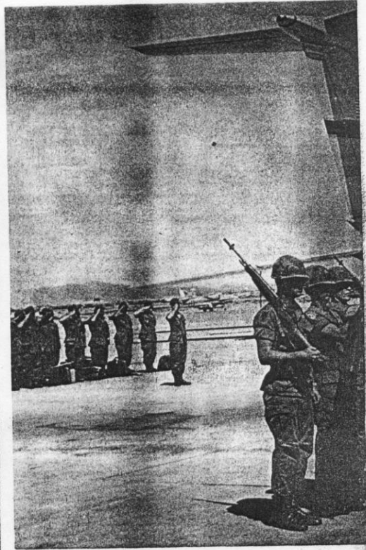
"Sir, the 6th Battalion, 56th Artillery, requests permission to proceed."