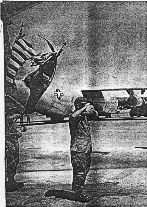
part the Republic of Vietnam."