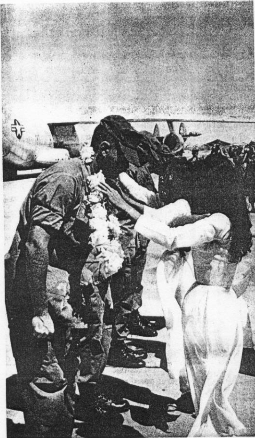
Vietnamese schoolgirls say goodbye to departing artillerymen.