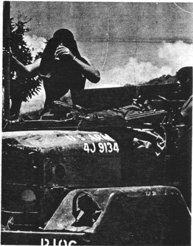
A pair of 23rd S&T drivers sit in their trucks, waiting for refugees to climb aboard.