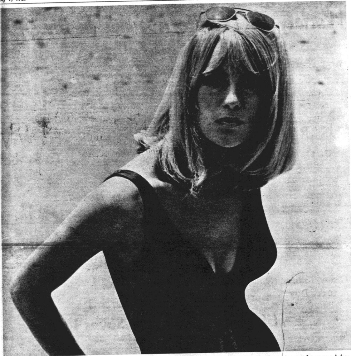
A pretty girl on a desolate beach is not in the offing around Southern I Corps, but the Americal Division history is, so order a copy before you return to the land of pretty girls.

RESERVE YOUR COPY OF THE AMERICAL DIVISION VIETNAM HISTORY NOW