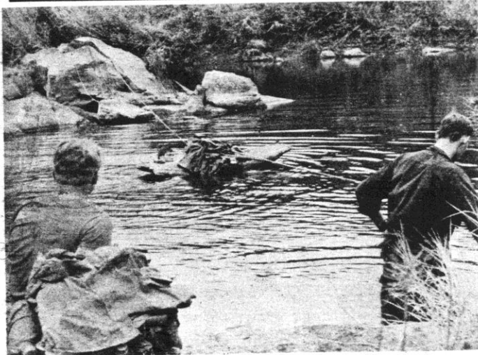
Fjord Every Stream

Up to his neck in an icy mountain stream, this "Polar Bear" from the 196th Bde.'s 4th Bn., 31st Inf., negotiates the forceful current by means of rope and air mattress. The infantrymen were sweeping the slopes of Nui Chom Mountain, scene of two intense battles late last year, for signs of renewed activity by NVA and VC forces.