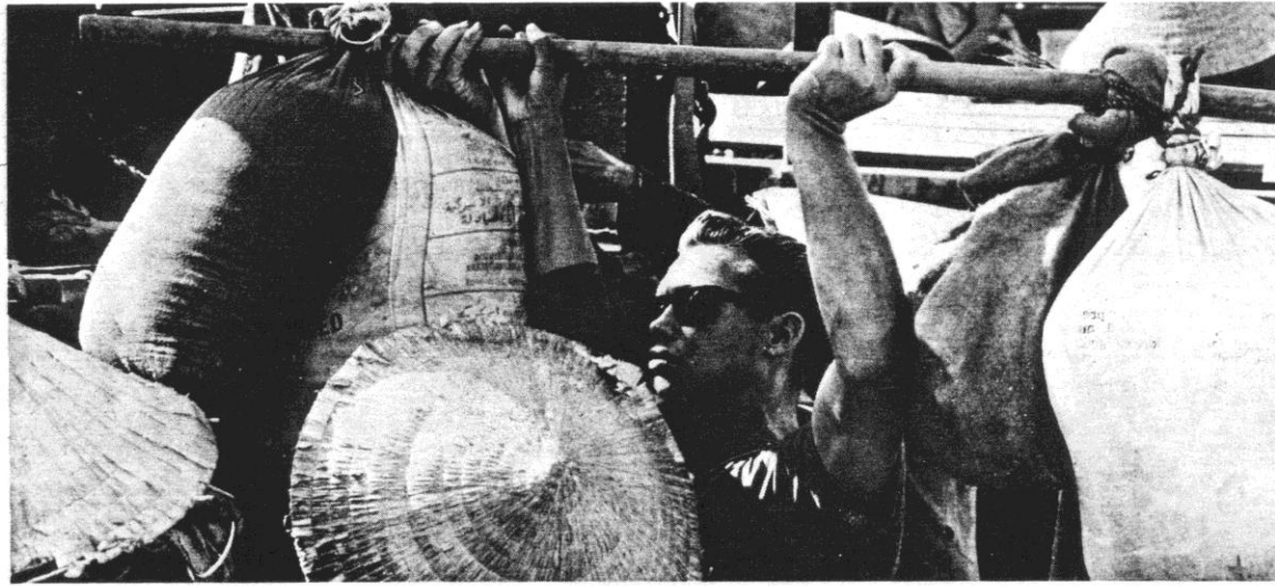
SP4 Bone helps the refugees in loading their precious sacks of rice aboard the waiting vehicles.