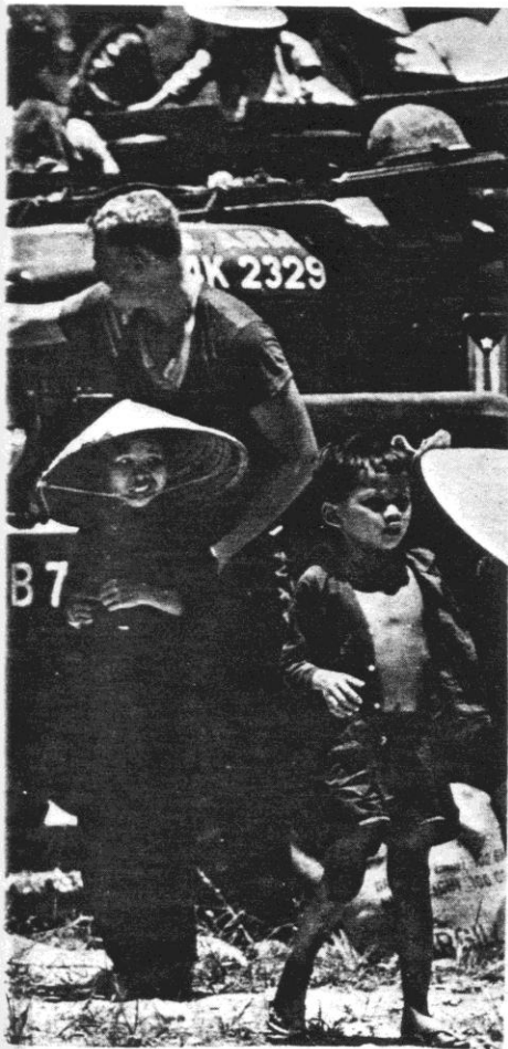
Supply and Transportation Bn.