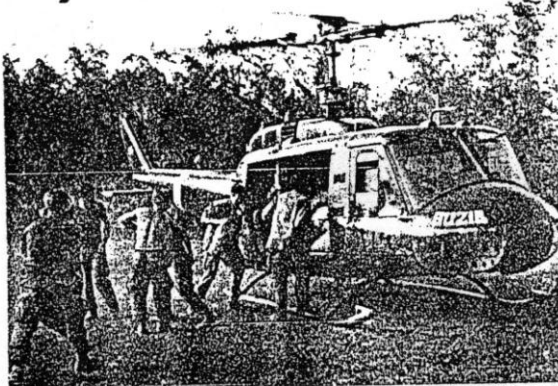
Soldiers of the 1st Battalion, 20th Infantry, 11th Infantry Brigade, load sacks of rice onto a helicopter which was part of the cache found 2 miles east of Mo Duc. The rice cache was distributed to Vietnamese families.