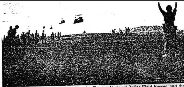
A combined team of Regional and Popular Forces, National Police Field Forces, and the Recon Platoon of the 1st Battalion, 20th Infantry stand quietly watching the helicopters come to pick them for a dawn combat assault.