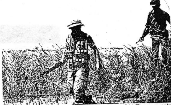
An 11th Brigade grenadier makes his way through a soggy rice field. The man, a member of Bravo Company, 1st Battalion, 20th Infantry, was part of a company sweep in the flatlands near Highway One.

himself as a regimental cook. He reported that he was ordered to wait in the valley for the element's return from the Nghia Hanh mission—thus far, no one had returned.