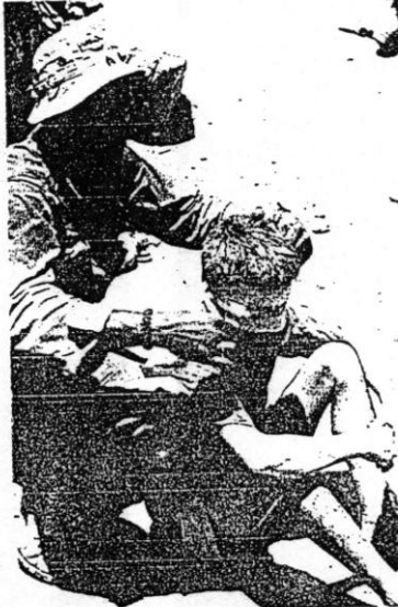
An unidentified sergeant from Delta Company, 4th Battalion, 31st Infantry blindfolds a Viet Cong suspect detained near Heip Duc. The detainee was later air-lifted to LZ West for interrogation.