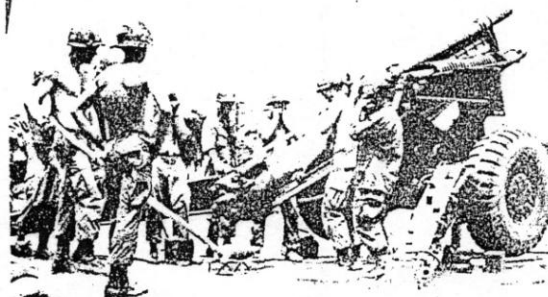
Cannoneers stand clear as their 155mm howitzer recoils with brute force, filling the cloudless afternoon sky with thunder. The men of Charlie Battery, 1st Battalion, 82nd Artillery are supporting Division operations south of Quang Ngai City.

The 105mm leaflet round appears to support Marshall McLuhan's contention that the "medium is the message."