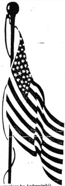
(Illustrations by Andrewjeski)