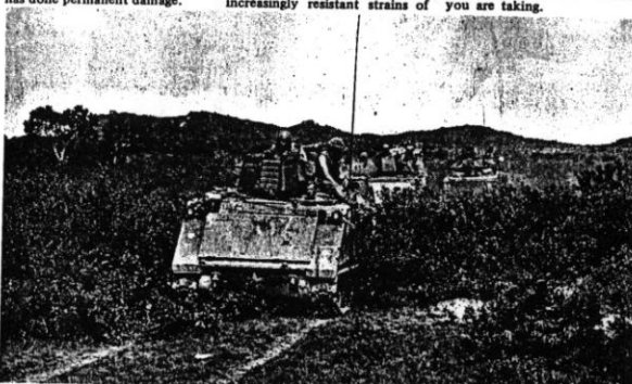
Breaking through a hedgerow is an armored personnel carrier from F Troop, 17th Cavalry. The cavalrymen are in an area 25 miles north of Tam Ky searching a suspected VC population.

Now you know the chances you are taking.