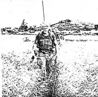
Company C, 1st Battalion, 20th Infantry, 11th Infantry Brigade, moves in line through a rice paddy in a search operation south of Chu Lai which yielded 97,500 pounds of rice.