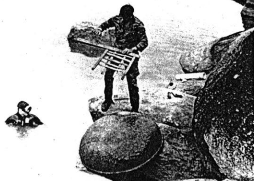
NAVY DIVERS GATHER fishing equipment hidden between large rocks.

Story & Photos By SP4 Peter Sorensen 11th Bde. IO