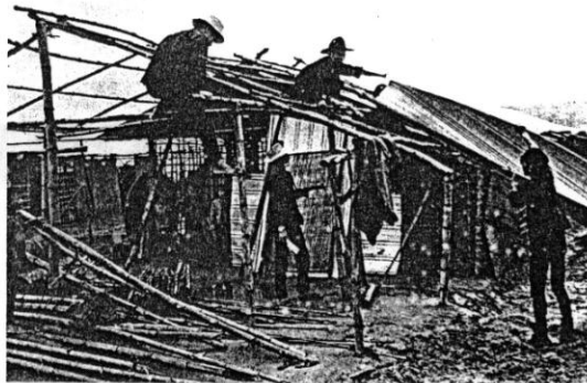
Home In Tu My