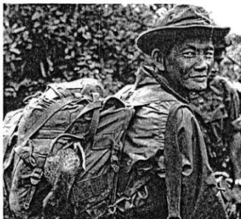
Going To Market

After the Vietnamese received their decorations, the band began to play as the spectators moved in to congratulate the soldiers.