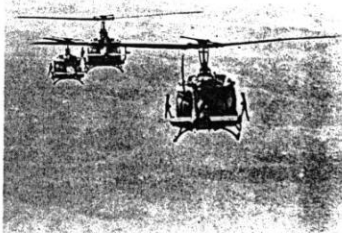
'Blues' Inserted A "Blue Ghost" helicopter of F Trp., 8th Cav. heads for a safe altitude after inserting men of the unit's aero-rifle platoon on a recent mission 10 miles northwest of Tam Ky.

It is the responsibility of every member of the military services from the newest inductee to the highest commissioned officer to accept other members on the basis of their individual worth and to assist in extending to all facets and activities of military life-on and off base, on and off duty-the spirit of mutual trust and respect which is manifest when our forces are in combat. I call upon every installation and unit commander to provide the leadership.