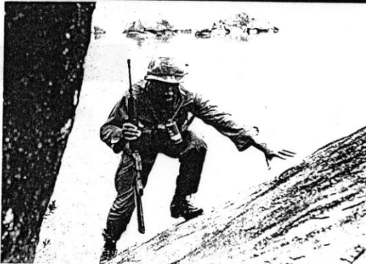
AN AGILE INFANTRYMAN scrambles along the rocks in the Song Tra Cau.