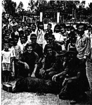
Caesar the pig placidly catches a few rays after his arrival at the Children's Relief Center in Quang Ngai City.

Since the orphanage is constantly seeking funds from various social agencies, the donation made by the division troopers should be a beneficial boost to the good work being accomplished.