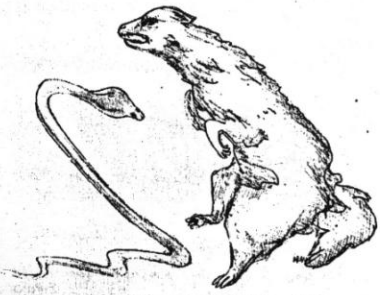
October 23, 1970