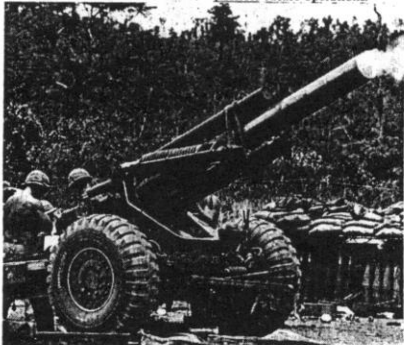
Artillerymen of Alpha Battery, 1st Battalion, 82nd Artillery keep their 155mm howitzer smoking while taking part in the six week operation at Kham Duc.