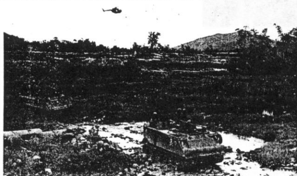
These division armored personnel carriers from the 1st Battalion, 1st Cavalry, move in column across a small stream near Hiep Duc.