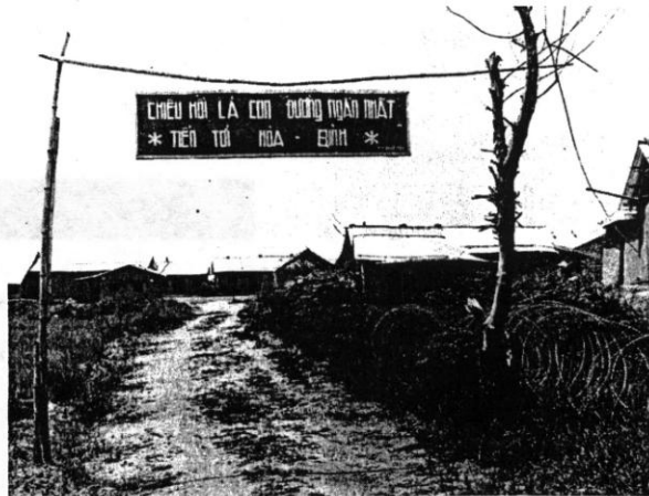
Lonely dirt road leads into the village of Hai Mon, which lay like a ghost town for the past five years. A recent reconstruction project resulted in the rebuilding of the village but the populace cannot move in until surrounding fields are irrigated properly for farming.

His assignments have ranged from the company level to the Pentagon and as an instructor at several service schools. His most significant assignments have been with the 25th Infantry Division in World War Two and Korea; USA Element Headquarters; United Nations Command and U.S. Forces, Korea; Office Assistant Chief of Staff, Intelligence, Washington D.C.; instructor at the Command and General Staff College; Plans and Operations Officer, Headquarters CONARC, Fort Monroe, Va.; Chief Research and Development, Washington D.C. and Associate Editor of the